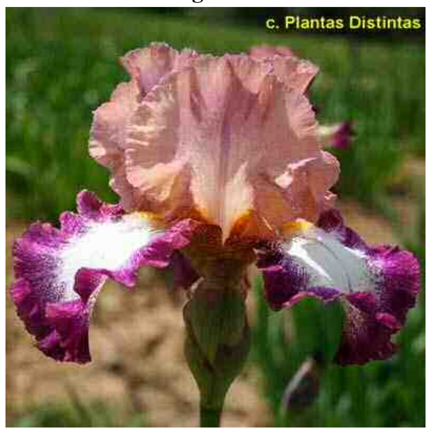
'Change Of Pace'. Schreiner, TB, height 35", Early to midseason bloom. Standards delicate pink; Falls white ground, deep rose violet <u>plicata</u> markings and peppering on edge; beards yellow. Schreiner 1991. Honorable Mention 1993 ; Award of Merit 1997 .