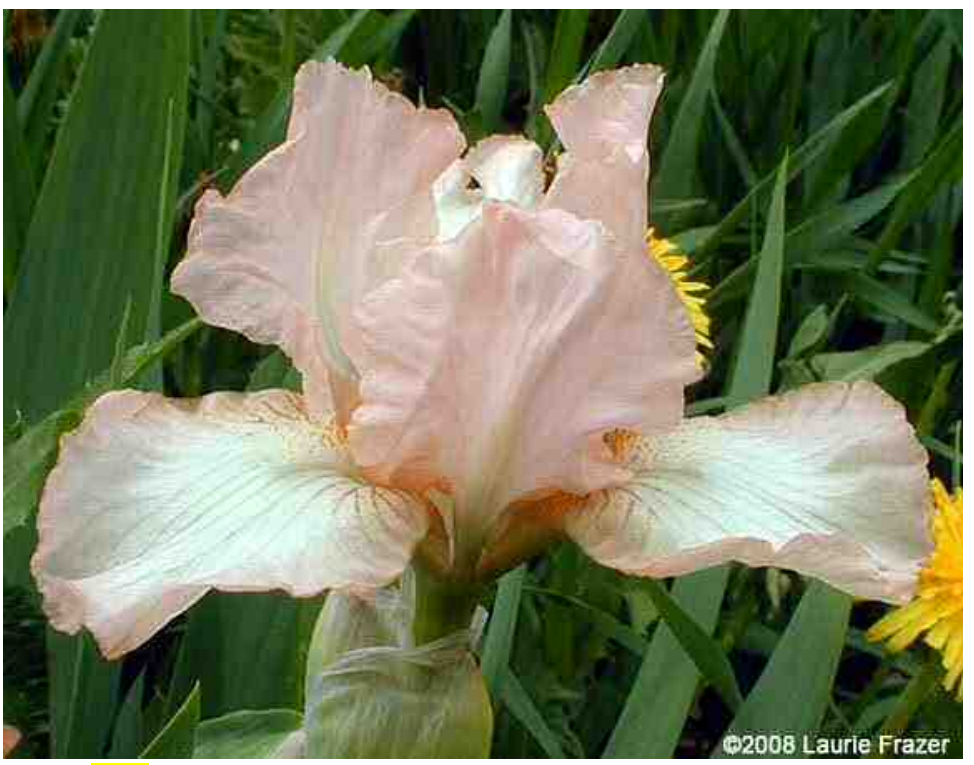
'Kiss Me Quick'. Barry Blyth, SDB, 15", Midseason late bloom. Standards light pink; Falls white, 1/4" light pink plicata edge; beards white, hairs tipped tangerine. Tempo Two 1996/97.