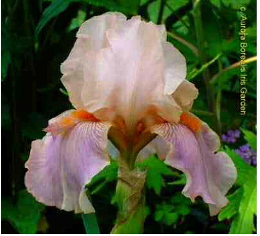
'Andiamo'. Harold Stahly, TB, 38", Early midseason bloom. Ruffled medium peach, Falls with light red wash extending from orange tangerine beard to near margin. Stahly 1997.