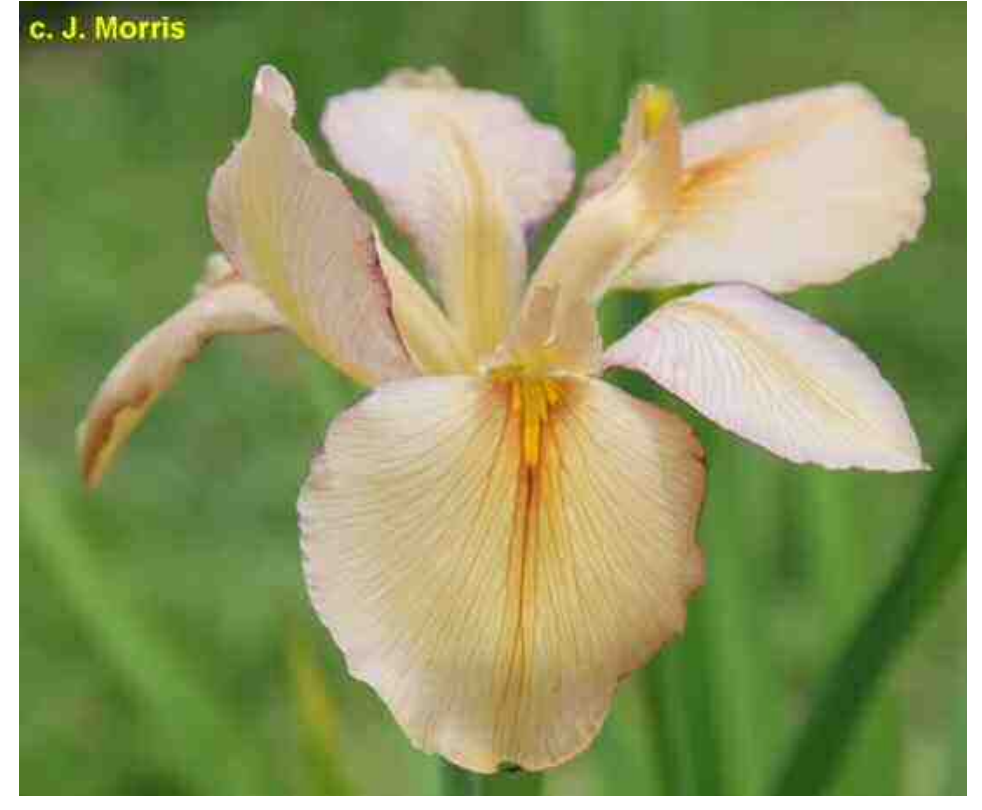
'Lady Regina'. Elaine Bourque, LA, 42", Early midseason bloom. Standards apricot-buff, slight purple veining; style arms same, slightly darker; Falls buff-cream, slightly veined purple, yellow gold crest signal. (Registered: 2008.)