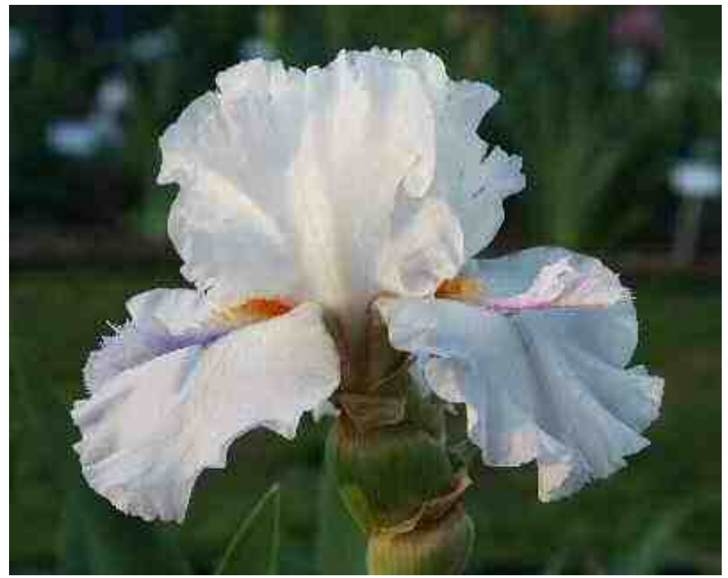
'Bombay Eyes'. Hooker Nichols, TB, 36" Early midseason bloom. Standards ice blue-lavender; style arms ice lavender; Falls lighter, chartreuse veining, sapphire triangle surrounding beard; beards yellow and powder blue, very short horns; ruffled, sculpted. Hillcrest 2009. Space Ager .