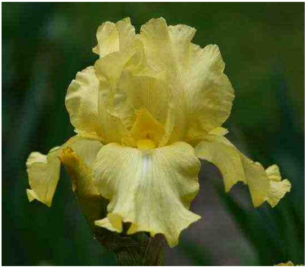
'Corn Harvest'. Carl Wyatt, TB, 30" Early to midseason bloom and rebloom. Full yellow self; ruffled Falls; full yellow beard. Melrose Gardens 1977. Historic, Rebloomer .