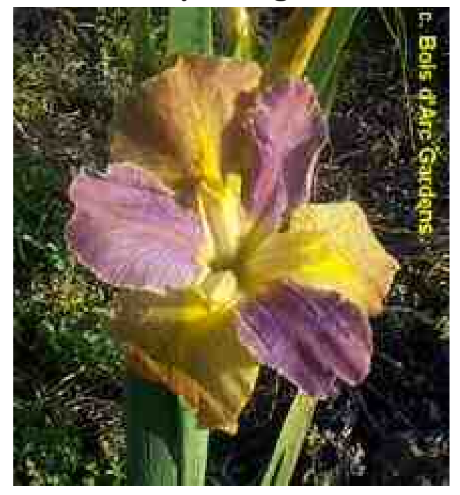
'Bayou Tiger'. Kirk Strawn, LA, 35, Late bloom. Standards red purple; style arms yellow; Falls greyed orange veined brown, orange signal. Bois d'Arc 1996.