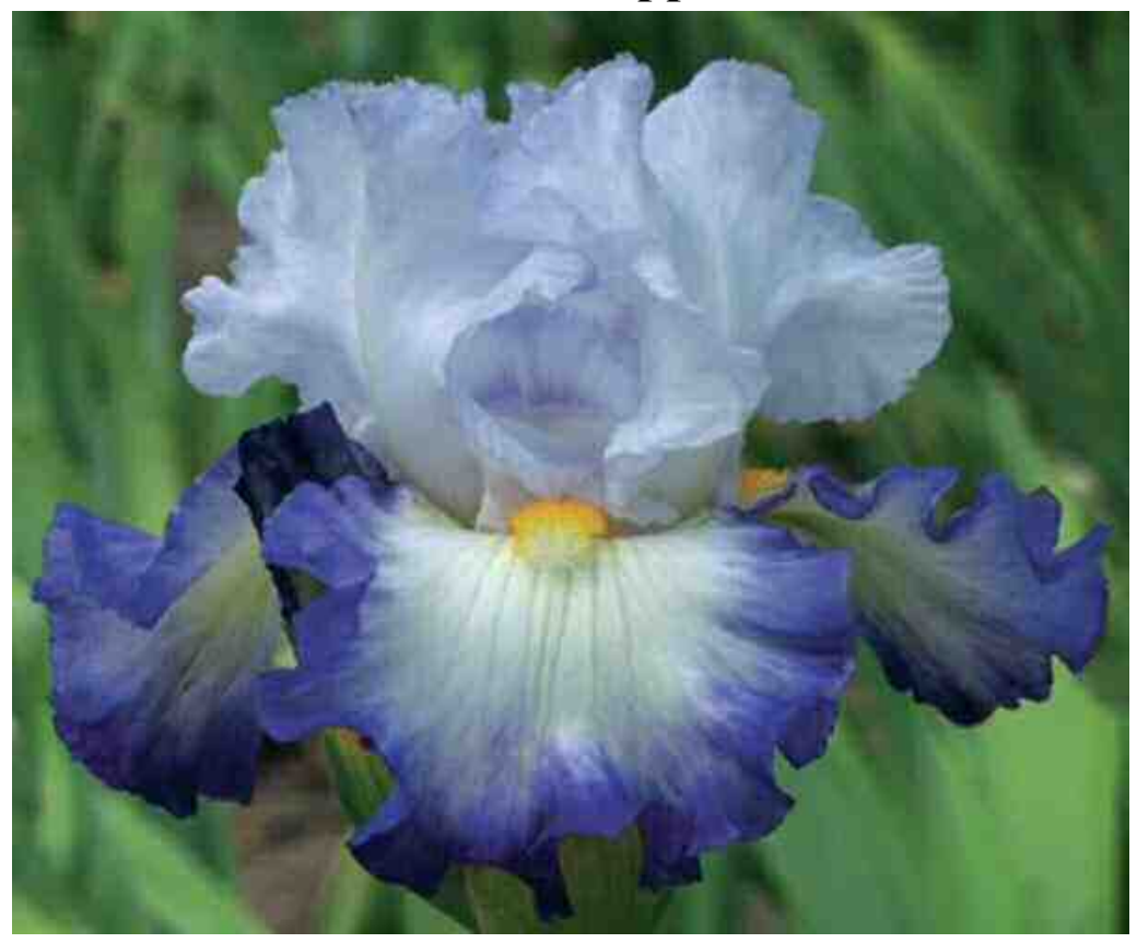
'Pursuit of Happiness'. Thomas Johnson, TB, 36", Midseason bloom. Standards blue white; style arms same, crests touched blue lavender; falls medium lavender-blue, large white central wash around deep lemon-orange beard; sweet fragrance. Mid-America 2007.