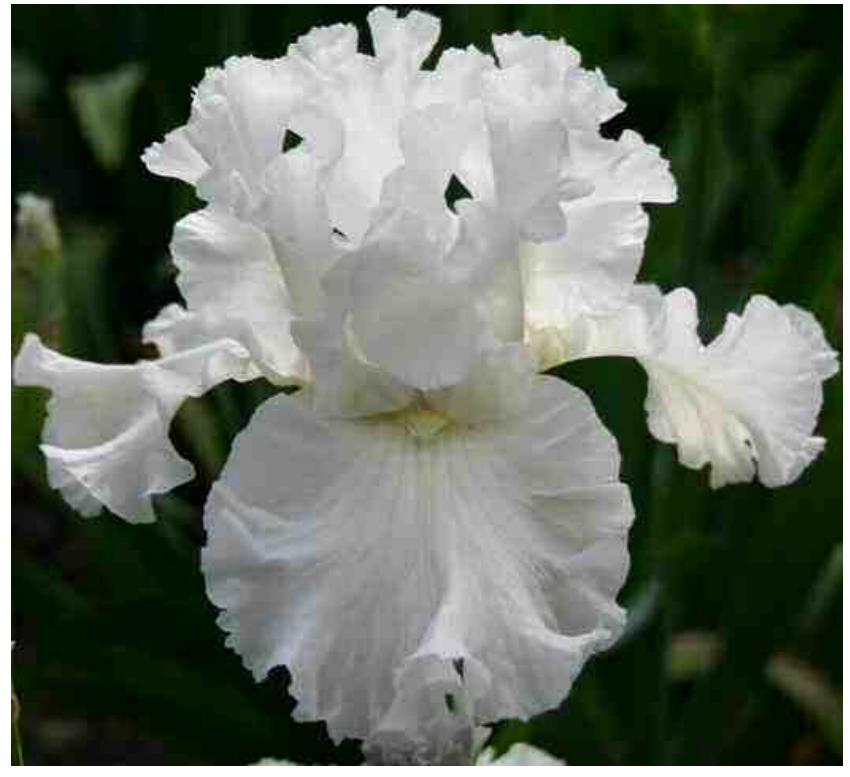
'Skating Party'. Larry Gaulter, TB, 34". Midseason to late bloom. Fluted white; lemon beard tipped white. Cooley's Gardens 1983. Historic .