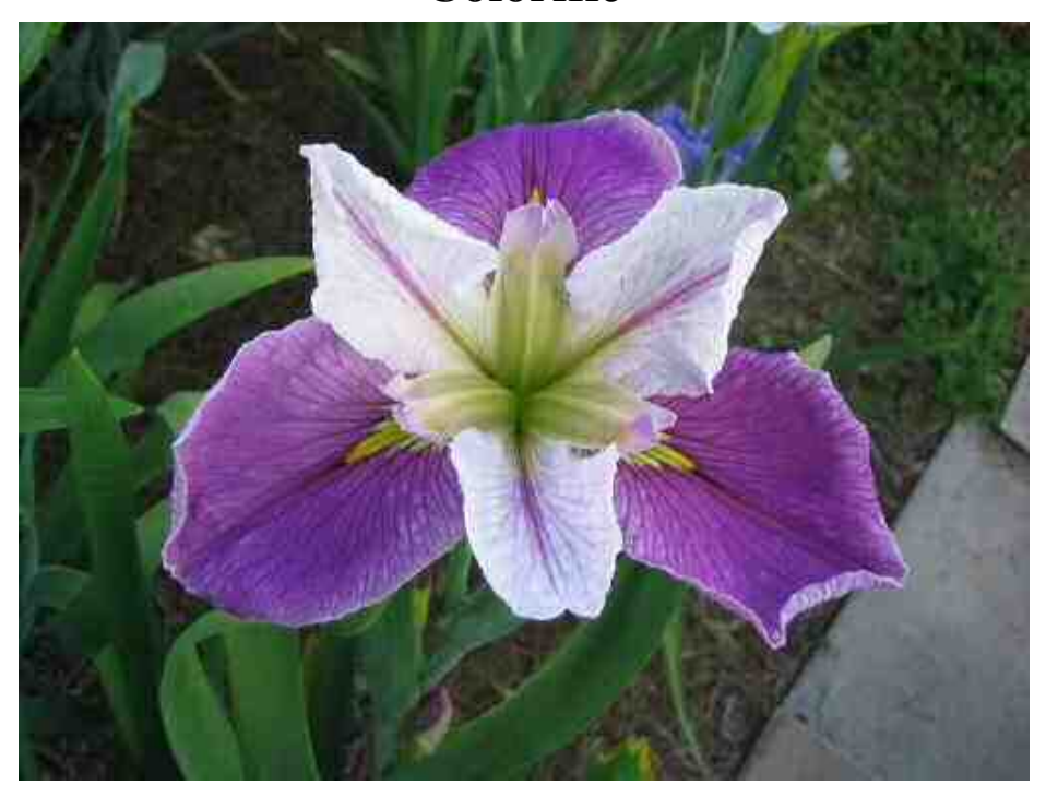
'Colorific'. Joseph Mertzweiller, LA, 32-36", Midseason bloom. Standards white with very pale lavender flush and lavender centerline; greenish white style-arms, flushed lavender at tip; Falls medium reddish purple, lighter toward center, darker purple veining; small yellow line crest. Charjoy 1979. Historic .