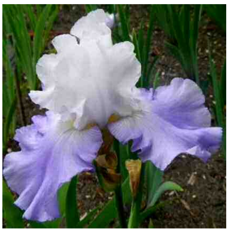
'Calm Stream'. Cy Bartlett, TB, 38", Midseason late bloom. Standards white, washed very pale lavender; Falls medium blue lavender; beards light lavender, yellow in throat; heavily ruffled; slight sweet fragrance. Sutton 1998.