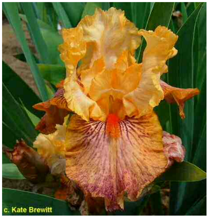
'Sailor's Warning'. Tom Burseen, TB, 35", Midseason bloom. Standards spanish orange blended darker at edges, open; style arms nasturtium orange; Falls buff orange blended nasturtium orange around edges, prominent red-purple veins and streaks; beards scarlet; wide, blocky, ruffled; pronounced spicy fragrance. Burseen 2011.