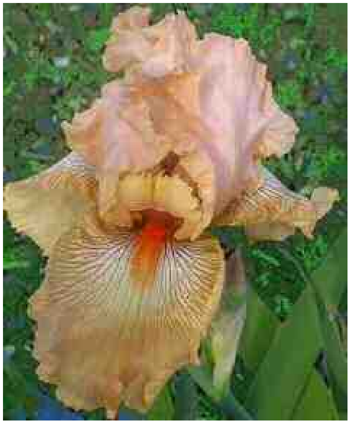
'Ample Charm', Tom Burseen, TB, height 36", Early bloom. Standards and style arms pinkish orange; Falls light orange, veined light red brown, white ray pattern from orange beard; ruffled; musky fragrance. TB's Place 1995.