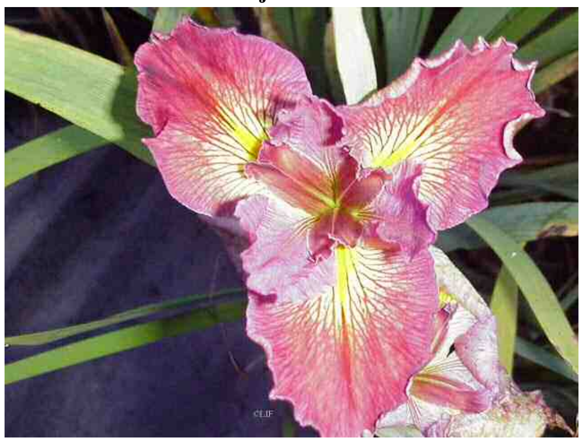
'Cajun Rose'. Henry Rowlan, LA, 33", Midseason late bloom. Standards magenta rose, narrow white halo; green styles edged yellow; magenta rose crest; Falls ruby red, center blending to magenta rose, narrow white halo, greenish yellow sunburst signal. Comanche Acres, Rowlan Irises 1989.