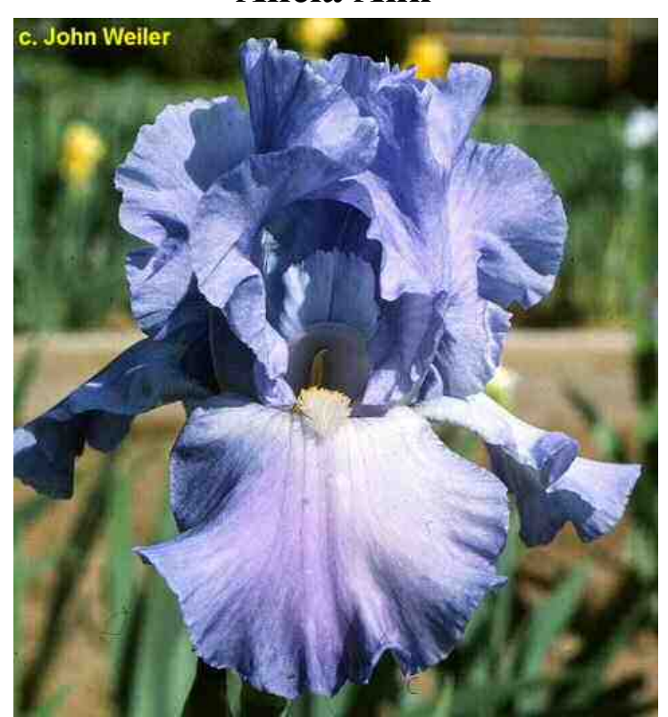
'Alicia Ann'. Darlene Pinegar. BB, height 26" Early, midseason and late bloom. Standards medium blue; falls medium blue, fading to light blue with near-white center; beards deep yellow, tipped light blue; ruffled. Spanish Fork 1993.