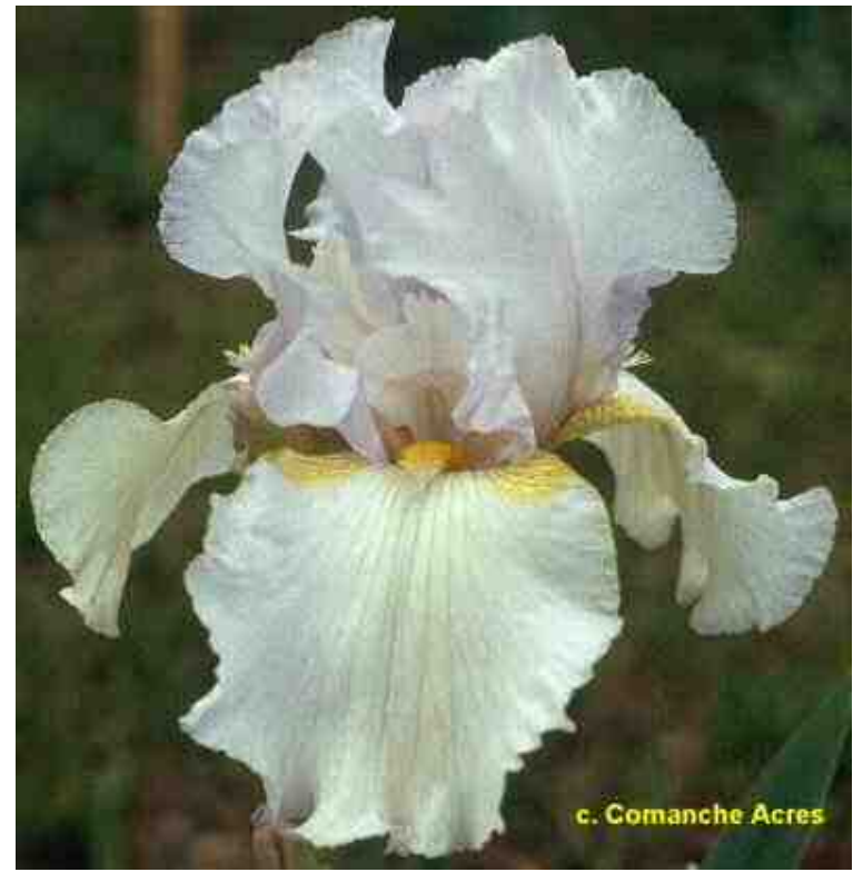
Hi Ho Silver

'High Ho Silver'. Monty Byers, TB, height 36", Early to midseason bloom and rebloom. Lightly ruffled silvery grey to silver white, tan gold hafts; light ground beard tipped gold; slight musky fragrance. Moonshine Gardens 1989. Rebloomer .