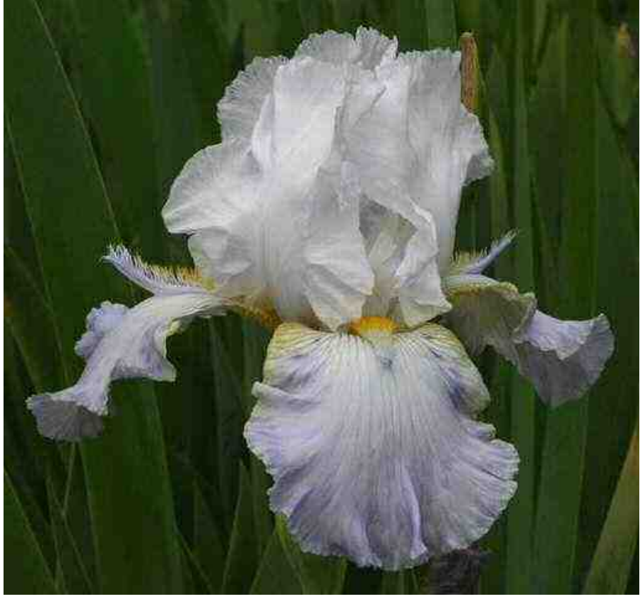
'Finally Betty' Tom Burseen, TB, 35", Midseason bloom. Standards white; Falls pale lavender; beards white, hairs tipped tangerine, with long fuzzy lavender blue horn; ruffled; slight fragrance. TB's Place 1999. Space Ager ,