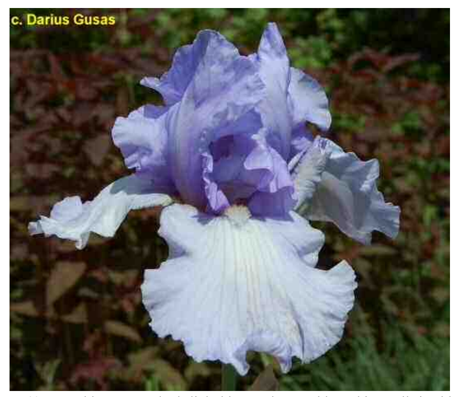
'Coastal Mist' Schreiner, TB, 40", Late bloom. Standards light blue; style arms blue white; Falls icy blue white; beards white, yellow base; pronounced sweet fragrance. Schreiner 1998.