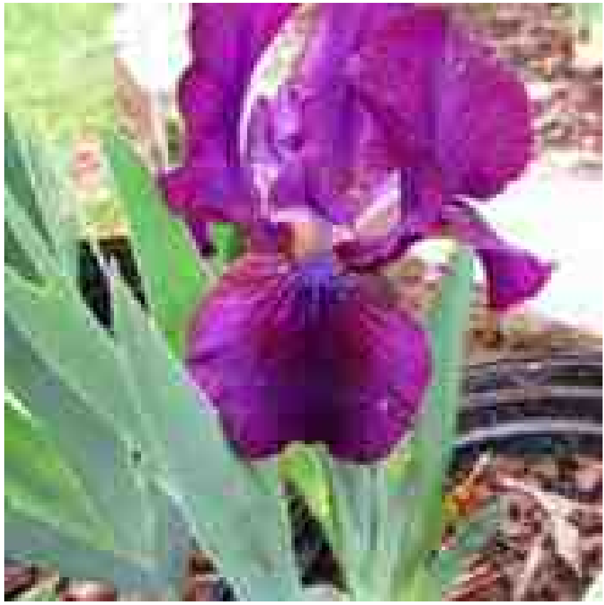
'Fairy Berry'. Anna & David Cadd, SDB , 14", Early bloom. Standards velvety reddish purple; style arms slightly lighter; Falls velvety deep purple, center darker; beards deep blue purple; slight sweet fragrance. Cadd's Beehive 2000.